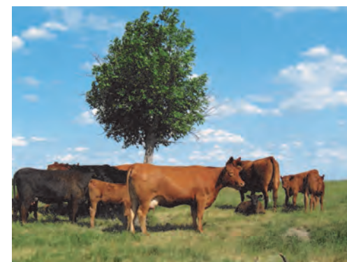
Dahl Land & Cattle Company, Gackle, North Dakota a World South Devon Tour stop.

The 2014 World South Devon Tour and Conference plans are being finalized and registrations are now being received.