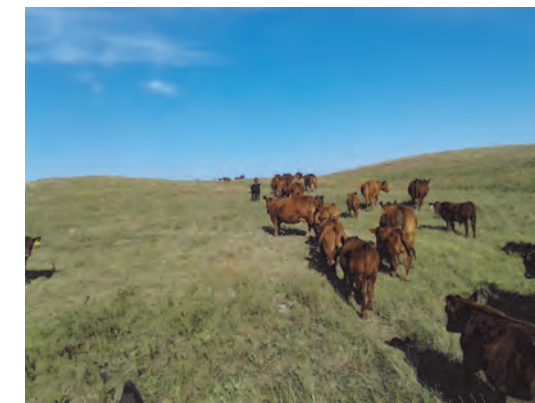
Special thanks to Dahl Land & Cattle Company, Gackle, North Dakota for the use of their photos in this issue of the NASDA news. These photos will also be entered in the 2014 South Devon photo contest.

Bollenbach Cattle Company, Joplin Stockyards, Triple Crown South Devons, Walnut Grove Farm, Showboat Cattle Company, Kansas State University, US Meat Animal Research Center, Nichols Farms, Hillcrest South Devon, JVM Cattle Company, KNN Farm, Valley Hill Farm, White Farms, Thompson Cattle Company, RP Farms and Popken South Devon, Schiefelbein Farms, DLCC Ranch, Wulf Cattle, T/K Ranch, Daybreak Ranch, Dahl Land & Cattle Company, Diamond Plus Cattle, MJB Ranch, Midland Bull Test, 4J Ranch, George Farms, Elkington, Brothers, Broken Spur Ranch, Wyoming South Devons, Malm Ranch, Leachman Cattle Company of Colorado, Colorado State University and Five Rivers Feedlot.